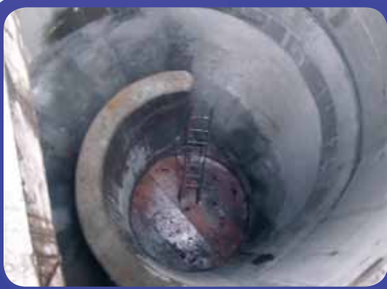
Surface runoff entering the dropshaft