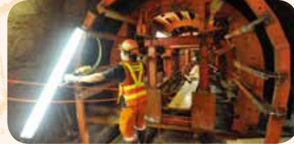
Adit lining works in progress

The adit lining construction works are now in full swing.