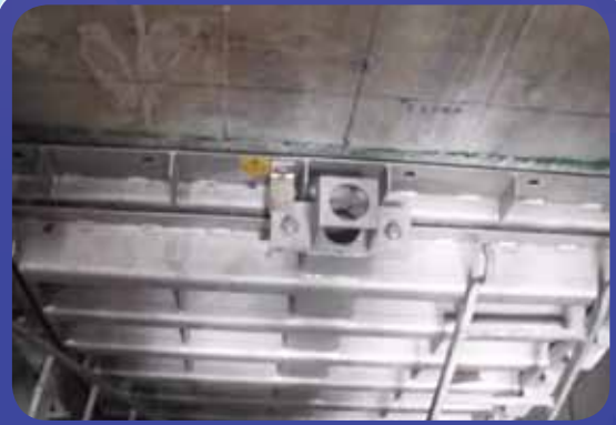
Penstock is the gate to prevent surface runoff entering the tunnel during maintenance