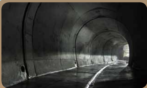
Adit tunnel to convey stormwater to main tunnel