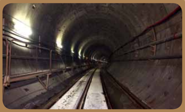
11km long main tunnel