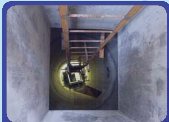
A shaft to allow surface runoff to fall from ground level down to the adit level