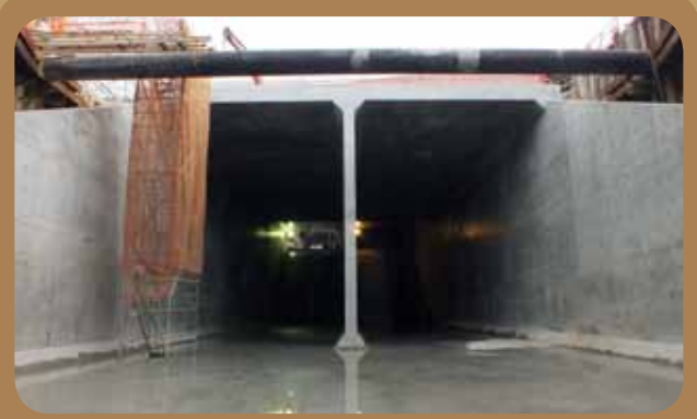
The discharge point of stormwater from the main tunnel - under construction