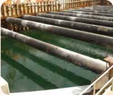
Stilling Basin at Western Portal

Currently, structural works for the river channel at Eastern Portal is in progress while that for stilling basin at Western Portal is undergoing as well.