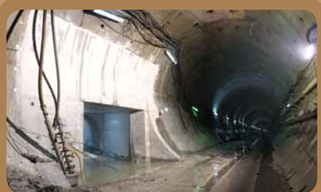
Junction of the main tunnel and adit tunnel - under construction