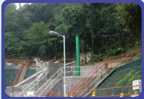
Overview of one of the 34 intakes - Intake MB16 at Mount Butler Road

Stormwater from Mid Levels will be intercepted and conveyed via dropshaft, adit and main tunnel to the sea.