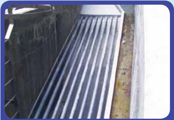
Surface runoff interception point at existing stream course and culvert