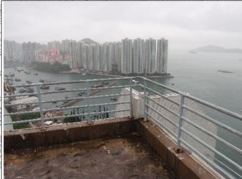
Noise Monitoring Location at Wah Lai House (M8)