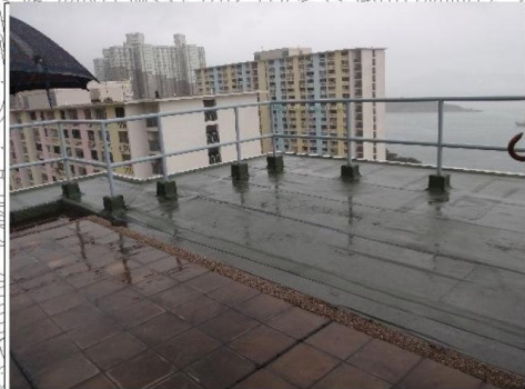
Noise Monitoring Location at Wah Ming House (M7a)