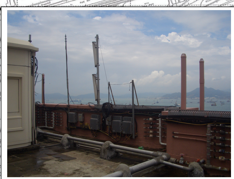
Noise Monitoring Location at Kwan Ying Building (M3)