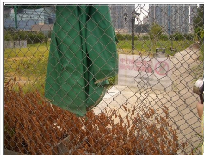
Air Quality Monitoring Location at The Arcade, Cyberport (CM_CB1a)