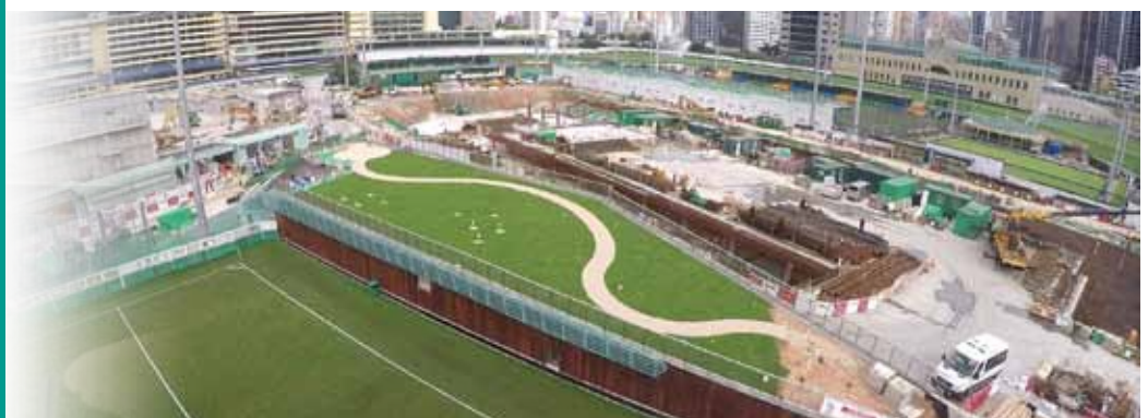
The landscape works at the architectural slope above the pump house 泵房上蓋的草地小山丘綠化工程