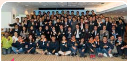
HVUOSS Project Team and Stakeholders 「跑馬地地下蓄洪計劃」項目團隊與持份者

透過是次工作坊，我們向各持份者匯報工程的最新進度，而各持份者亦讚揚我們過去一年的工作表現。