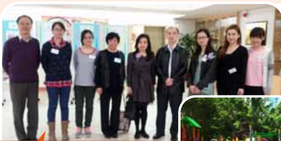
Representatives of St. Paul's Secondary School and HVUOSS Project Team