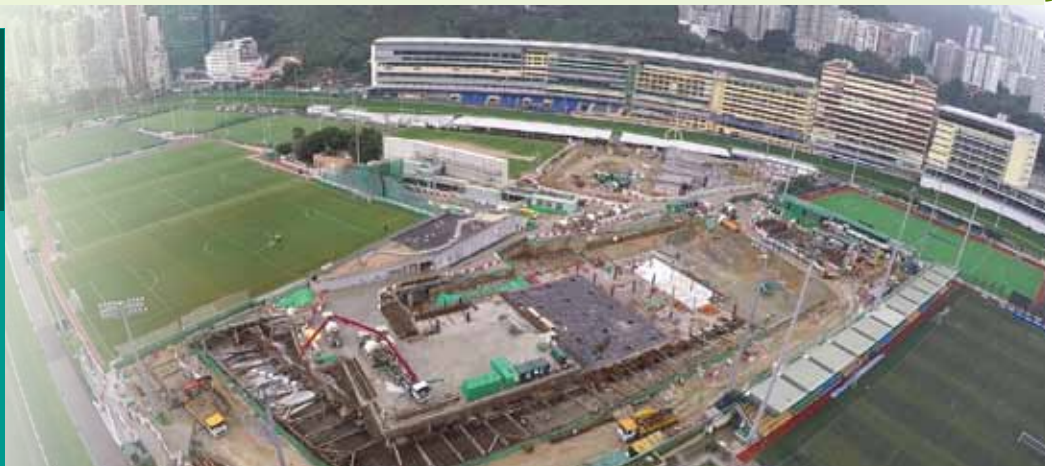
Construction of underground stormwater storage tank 地下蓄洪池的興建工程

本工程現正進行第二期地下蓄洪池的挖掘及混凝土結構工程，進度理想，預計整個蓄洪池可於2017年雨季來臨前投入使用。另外，泵房上蓋的草地小山丘綠化工程及風扇房的外牆木板安裝工程亦正在進行中，而新更衣室及洗手間預計會於2016年第三季開放予公眾使用。