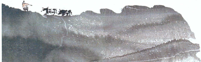
(FUNG Wing-cheong) (Management Representative) (March 2020)